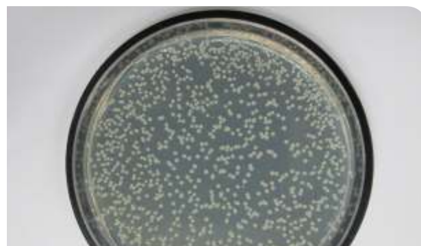
Bacterial recovery from untreated article.