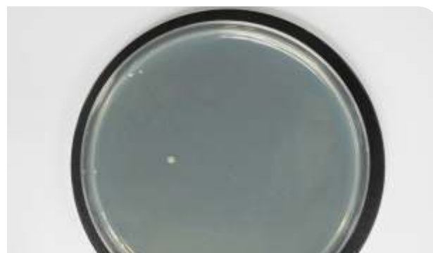
Bacterial recovery from treated article.

To assess antibacterial performance, samples treated with the XS Echocel® formula are tested using a quantitative bacterial test procedure. The recommended tests are ISO20743 and JIS1902.